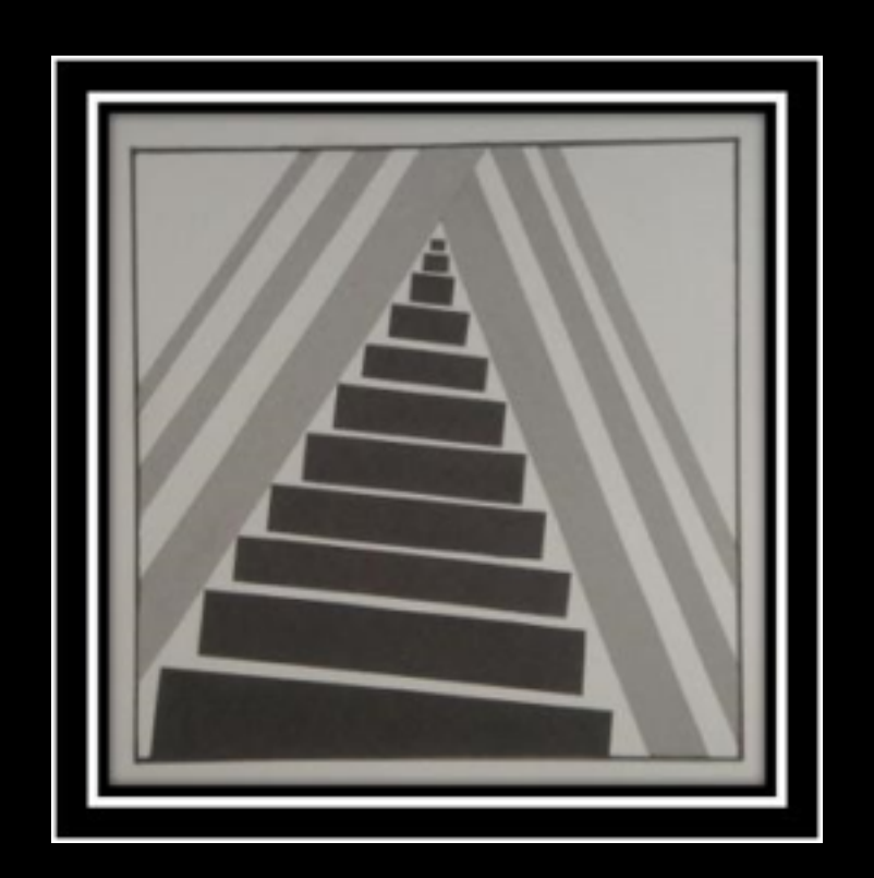
Contrast of Direction & Value